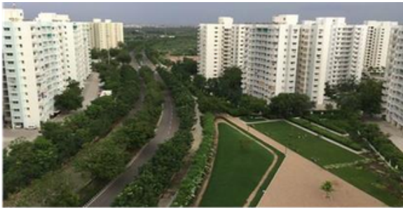
BUILDINGS & STRUCTURES