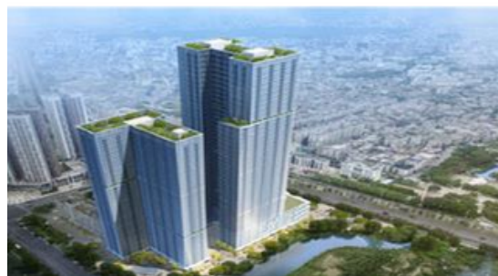
RESIDENTIAL-HIGH RISE. TOWNSHIPS